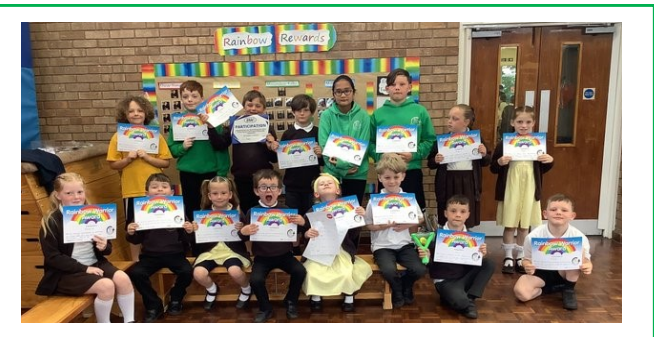
Congratulations to our Rainbow Reward Winners!